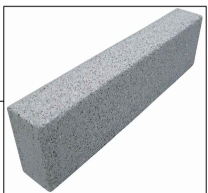
Country kerb PCC granite aggregate kerb (125x255x915mm) (Tobermore or equal approved)