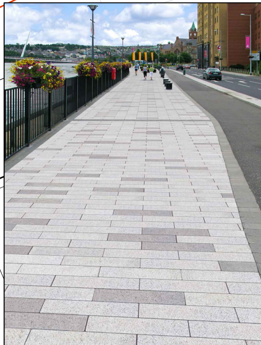
Manhattan PCC granite finish blocks (600x150x80mm); 75% silver - 25% mid grey (Tobermore or equal approved)