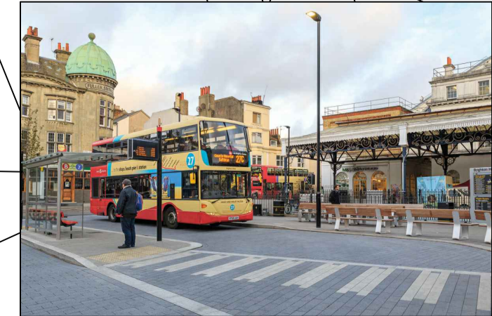
City-pave Vs5 granite aggregate blocks (150x100x100mm); dark grey & sandstone to crossing (Tobermore or equal approved)