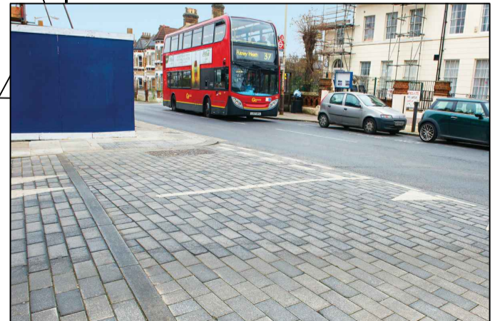
City-pave Vs5 granite blocks to parking bays (150x100x100mm); 75% dark grey - 25% mid grey (Tobermore or equal approved)