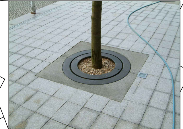
Escofet Carmel tree grille 1200mm 2 (Marshalls or equal approved)