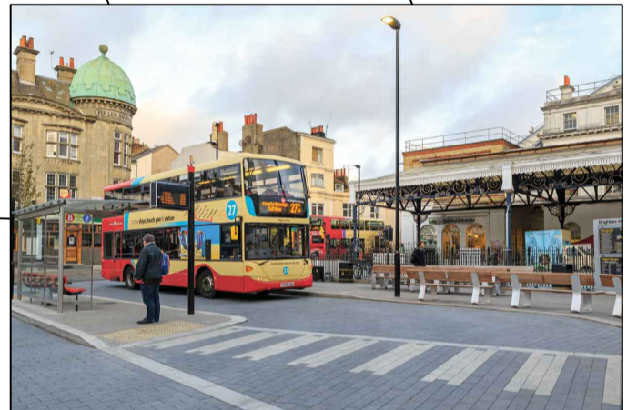
City-pave Vs5 granite aggregate blocks (150x100x100mm); dark grey & sandstone to crossing (Tobermore or equal approved)