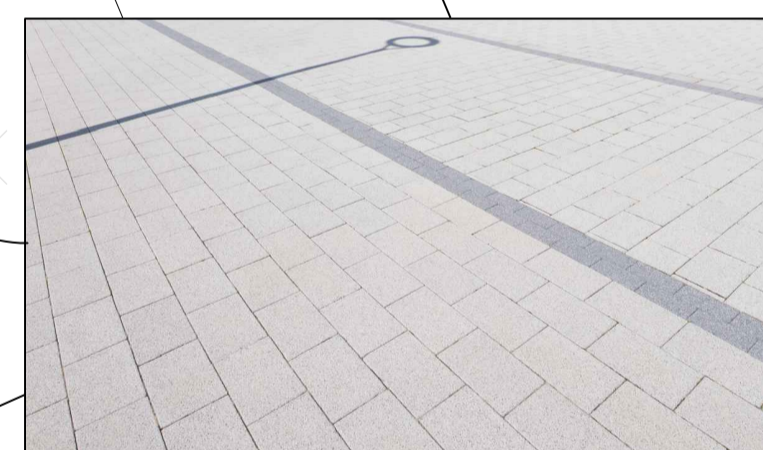
Fusion granite textured PCC blocks (600x300x60mm); Silver finish with Graphite trim (Tobermore or equal approved)