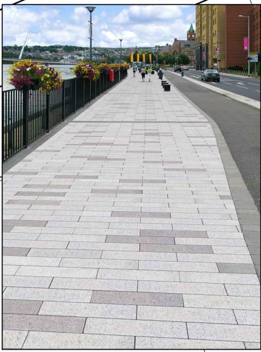
Manhattan PCC granite finish blocks (600x150x80mm); 75% silver - 25% mid grey (Tobermore or equal approved)