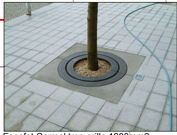
Escofet Carmel tree grille 1200mm2 (Marshalls or equal approved)