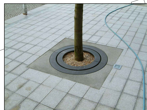
Escofet Carmel tree grille 1200mm 2 (Marshalls or equal approved)