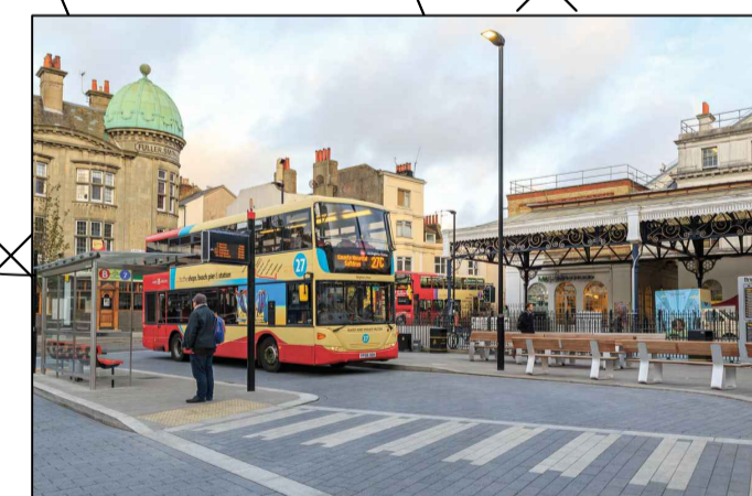
City-pave Vs5 granite aggregate blocks (150x100x100mm); dark grey & sandstone to crossing (Tobermore or equal approved)