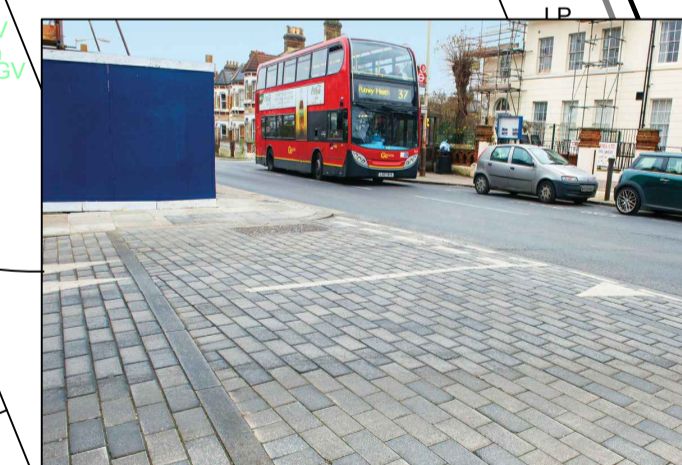
City-pave Vs5 granite blocks (150x100x100mm); 75% mid grey - 25% dark grey (Tobermore or equal approved)