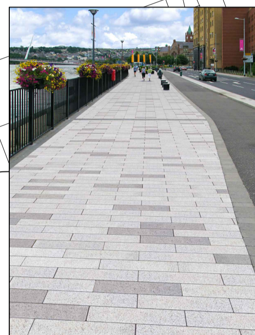
Manhattan PCC granite finish blocks (600x150x80mm); 75% silver - 25% mid grey (Tobermore or equal approved)