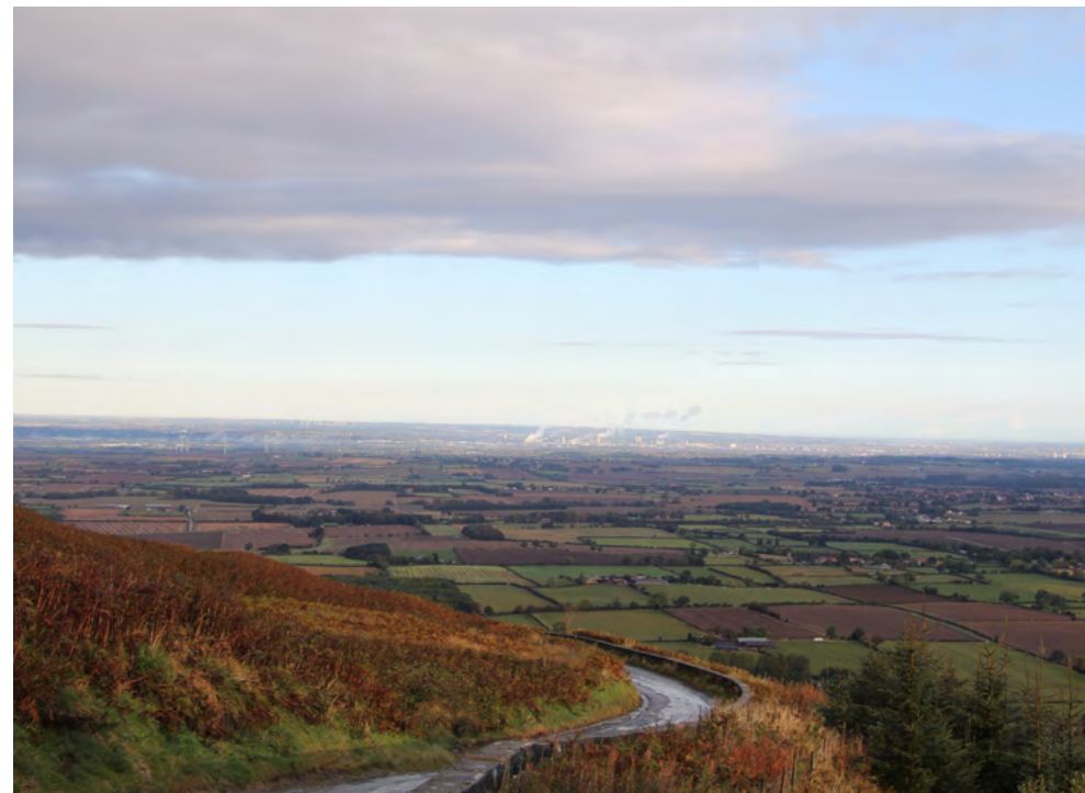
Wide views are afforded from the steep escarpment of the Cleveland Hills over the broad, low-lying plain to the industrial development beyond.

There are a number of major transport corridors through the NCA. The East Coast Main Line railway, the A1(M) motorway and A19 trunk road provide links through the Vale of Mowbray NCA to the south, and northwards to the Tyne and Wear conurbations and beyond.