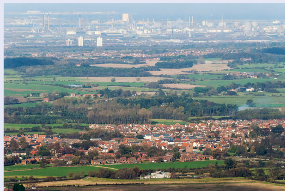
Industrial development fringing the tidal reaches of the River Tees contrasts with the surrounding rural landscape.