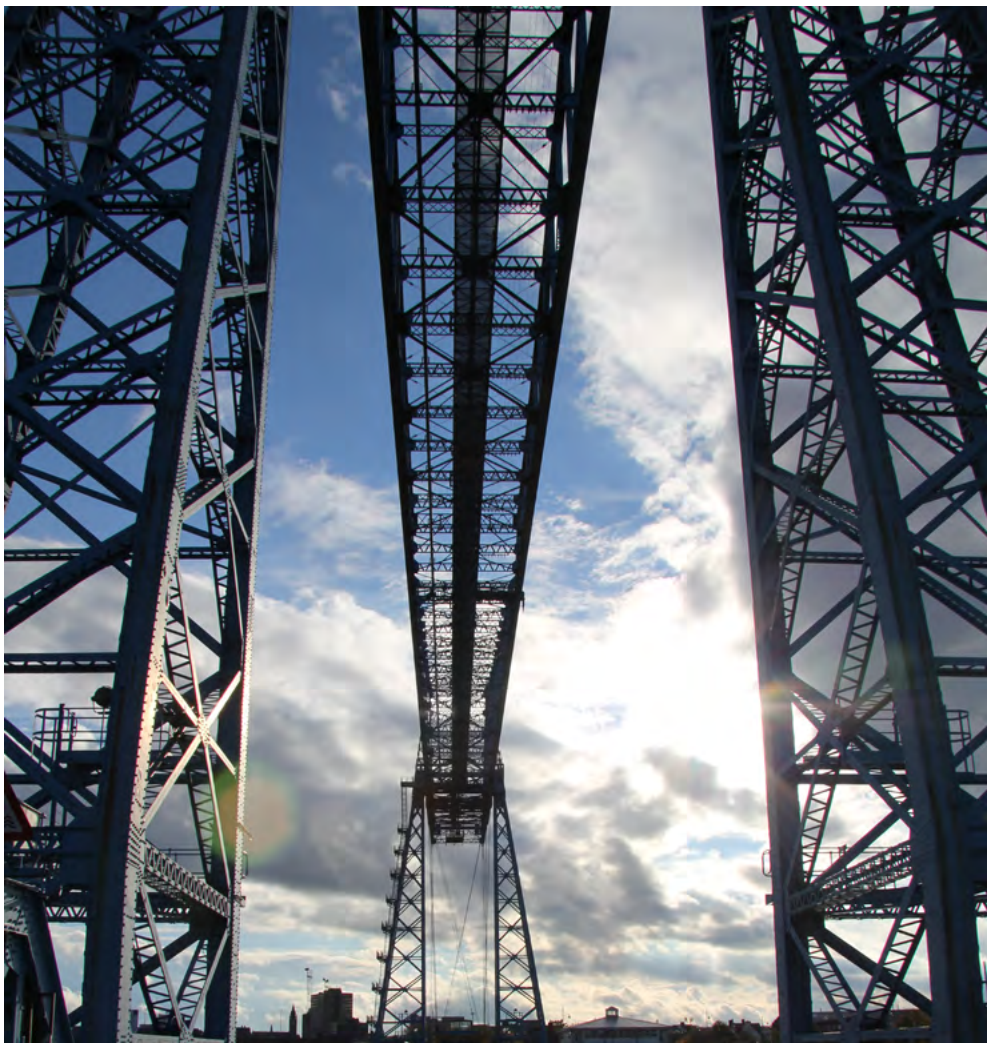
Industrial expansion at Teesside resulted in the rapid expansion of the transport network, including the construction of Middlesbrough's iconic Transporter Bridge.

Middlesbrough grew rapidly from a single farmstead in 1830 to a sizeable, planned settlement for workers leaving farmland under the enclosures to seek work in the new shipyards and steelworks. The transport network developed rapidly and many bridges were created across the lower reaches of the Tees, including the iconic Transporter Bridge and Newport Bridge in Middlesbrough. Land reclamation resulted in the loss of many areas of intertidal habitat (although remaining areas are now protected as part of the Natura 2000 designation). Coastal anti-invasion defences, such as at Greatham Creek, testify to the area's vulnerability to invasion during both World Wars. The Tees Barrage was constructed in the early 1990s to control tidal flow and boost urban regeneration in Stockton-on-Tees, but may also have influenced sedimentation in the estuary.