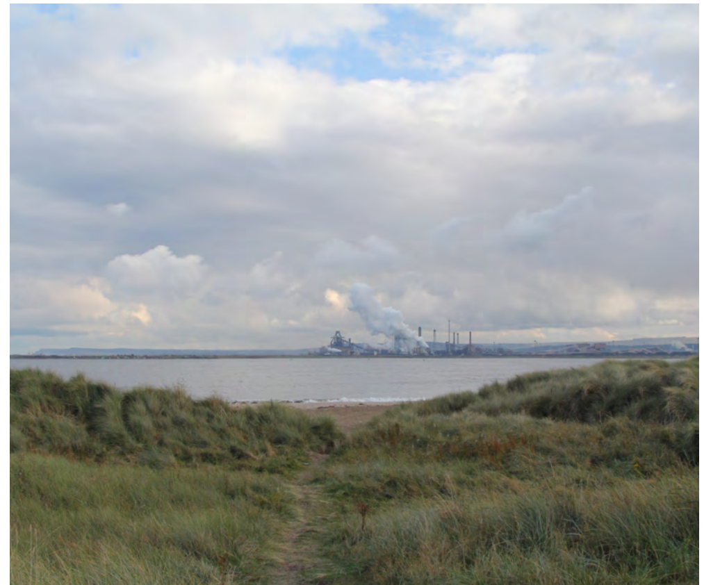
At Teesmouth National Nature Reserve, access can be gained to the dune systems at North Gare.

Biodiversity and geodiversity are crucial in supporting the full range of ecosystem services provided by this landscape. Wildlife and geologically-rich landscapes are also of cultural value and are included in this section of the analysis. This analysis shows the projected impact of Statements of Environmental Opportunity on the value of nominated ecosystem services within this landscape.