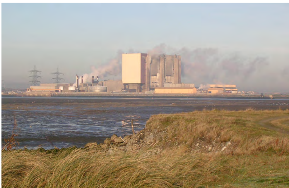
Large-scale industrial installations such as the nuclear power station at Hartlepool are juxtaposed with internationally designated inter-tidal habitats.

The Tees Lowlands NCA forms a broad, low-lying plain around the lower reaches of the River Tees, which meets the North Sea at Teesmouth on a north-east facing coastline. It is defined to the south-east by a steep escarpment to the plateau of the Cleveland Hills, with more gradually rising land to the west. The underlying geology of the area consists principally of red mudstones and sandstones, but this is overlain by a thick layer of glacial and alluvial drift material. However, sandstones and shales can be seen outcropping at the coast in places.