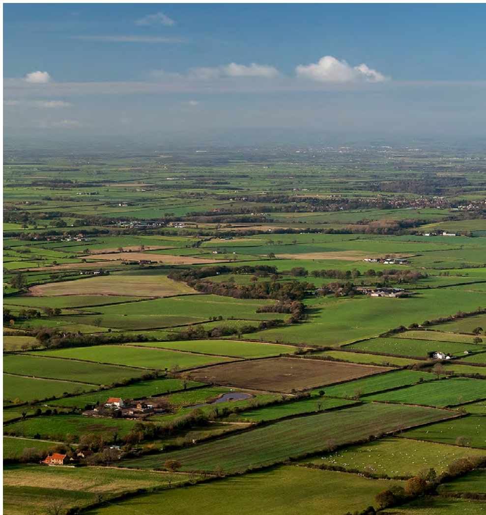
The Tees Lowlands are dominated by high quality, mainly arable farmland with scattered trees and hedgerows.