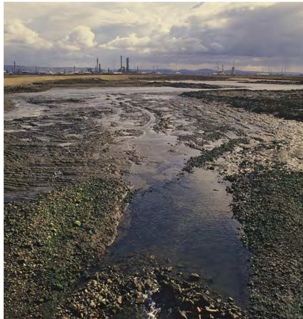
This tidal scrape at Seal Sands is one of a number of different inter-tidal habitat types found at Teesmouth.

A major north-south transport corridor, which includes the A1(M) motorway and East Coast Main Line railway, runs through the NCA. Other major routes include the A19 and A66 through the Teesside conurbation and the iconic Transporter Bridge across the Tees. These routes, together with other infrastructure elements such as power lines and wind turbines, form conspicuous elements in the landscape, particularly around the Teesside conurbation.