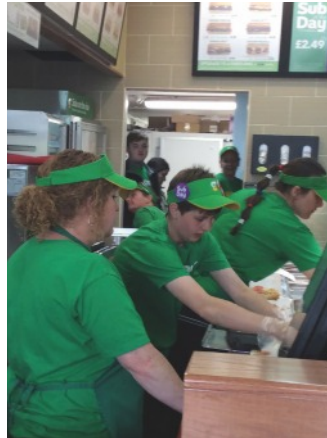
Pictured working in the Billingham Subway Store.

If you would like to be involved, phone 01429 857080 or email YEI@hartlepool.gov.uk