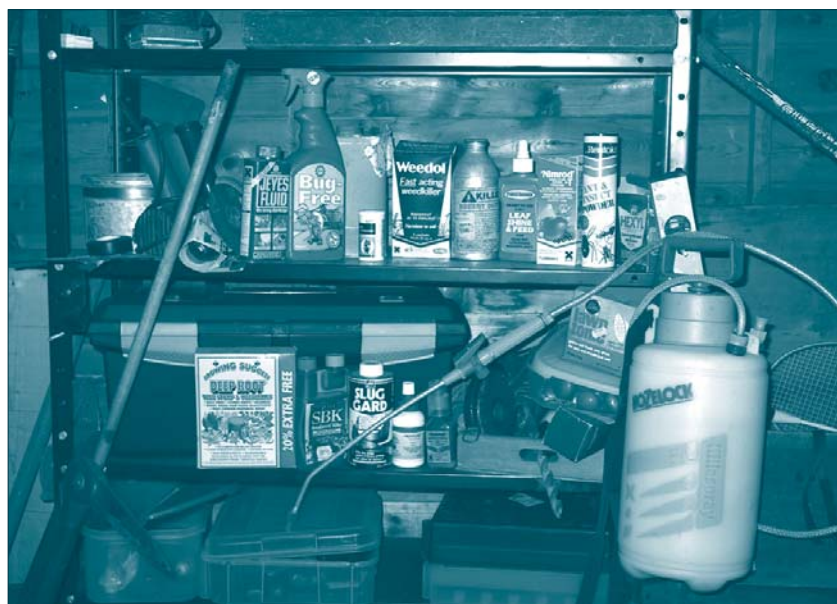
Never decant pesticides into other containers

Garden Organic provide advice and publications on methods of pest control that do not require pesticides and gardening methods that reduce pest attack.