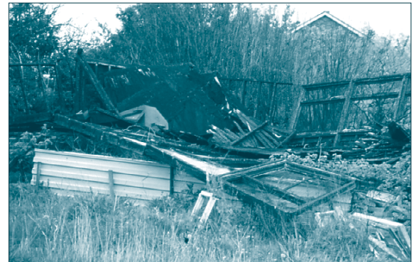
Trading huts are a popular target for arson attacks

Make your local fire service aware of the items that are stored in your hut and get site-specific advice from them regarding fire extinguishers, legal requirements and fire prevention. Draw up an emergency action plan. A list of emergency contact numbers should be clearly displayed on-site so that it is visible to any emergency services called to the site.