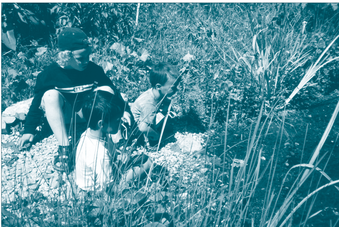
Children are fascinated by pond life

Plotholders often have limited space and small containers, such as a washing up bowls, are popular on individual plots to attract wildlife and improve aesthetics. Where smaller ponds or containers are to be used, sloping sides should be incorporated into the design and vegetation should not be allowed to grow over and conceal the pond.