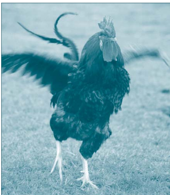
Cockerels have ruffled many feathers on allotments, as only hens are allowed

Contact your local city farm (if you have one) for advice on training in livestock care; they may know where to access it or may wish to organise a joint training course. Local agricultural colleges may also provide training.