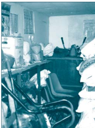
An untidy trading hut presents hazards to users

parties should ensure the legal documentation is up to date and that each is aware of their liabilities. Allotment authorities should keep up to date with the activities of site trading huts they have permitted.