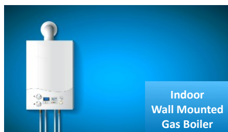
Indoor Wall Mounted Gas Boiler

Pacifica Home Services are based in County Durham and are Government Trustmark approved installers of Hybrid Heat Pump Systems.