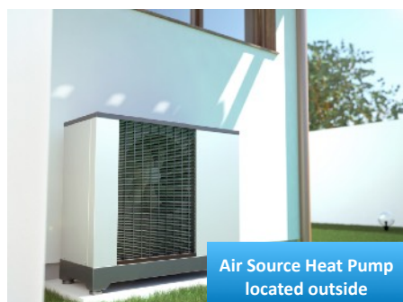
Air Source Heat Pump located outside