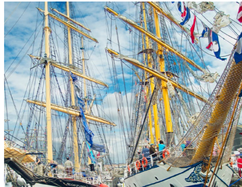
The world-famous Tall Ships' Race will return to Hartlepool in July 2023