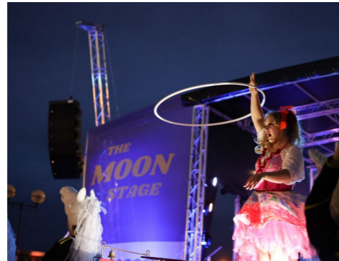
Hartlepool Waterfront Festival 2021 was a big success