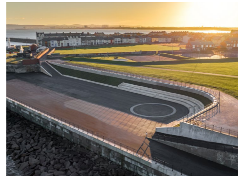
Completed work on Elephant Rock, our restored outdoor events space on Hartlepool's Headland