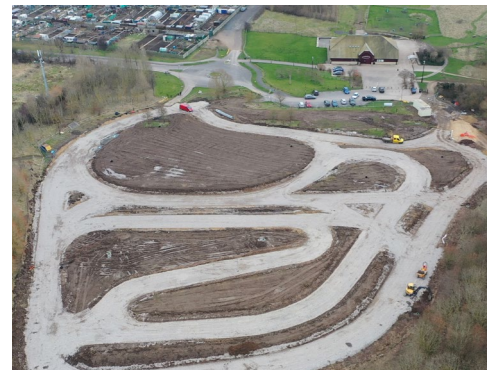
The construction of an accessible cycling track at Summerhill Country Park has been completed