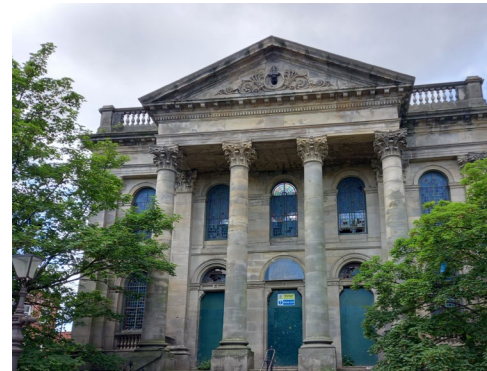
Hartlepool won its bid for £25m of government funding to further improve the town centre