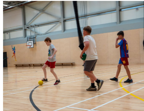
Holiday Activities and Food Programme supported over 3,000 children