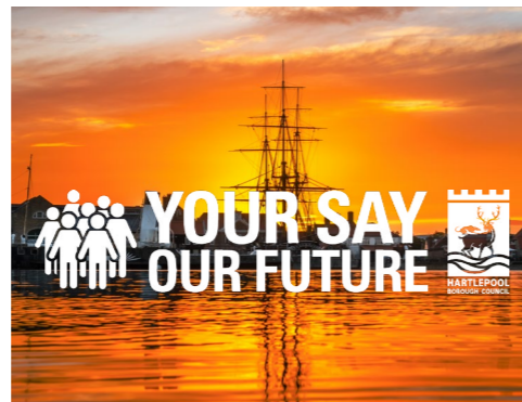
Launched 'Your Say, Our Future' our new online engagement platform