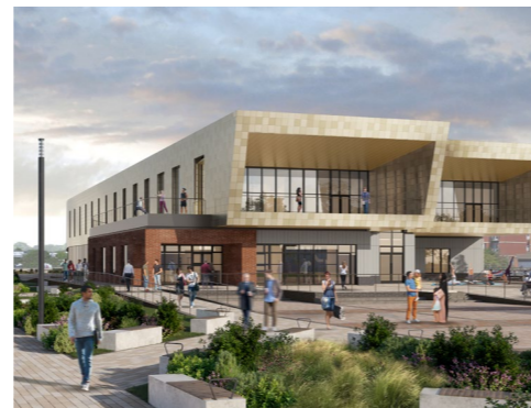
Highlight – the place for sport and leisure you've been waiting for