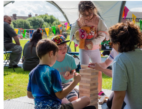
Our 'Summer at Seaton' event's programme brought a fun-filled family summer to Seaton Carew