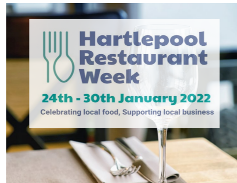
Delivered Hartlepool Restaurant Week to help promote eateries after lockdowns