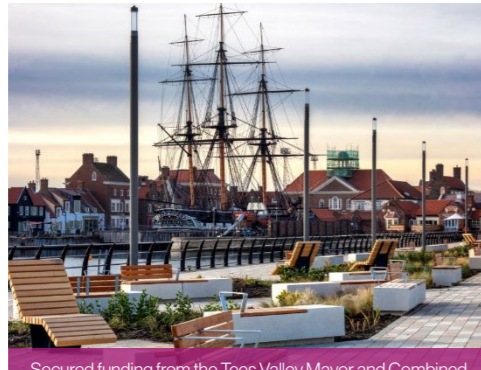
Secured funding from the Tees Valley Mayor and Combined Authority to help the National Museum of the Royal Navy Hartlepool purchase the neighbouring Vision Retail Park