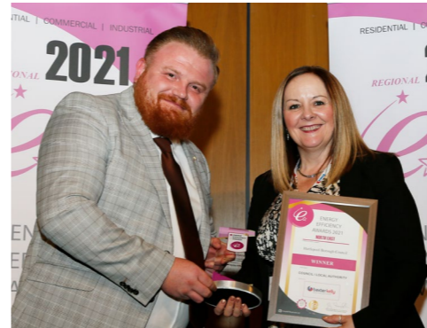
Won Council of the Year at the North East Regional Energy Efficiency Awards