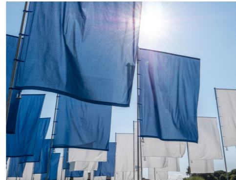
Hosed Luke Jerram's 'In Memoriam', an artistic memorial to victims of the Coronavirus pandemic