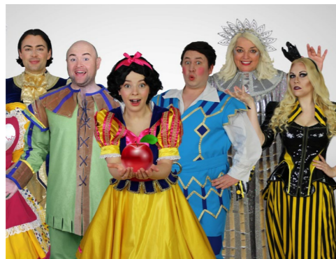
Snow White and the Seven Dwarfs provided entertainment for all the family