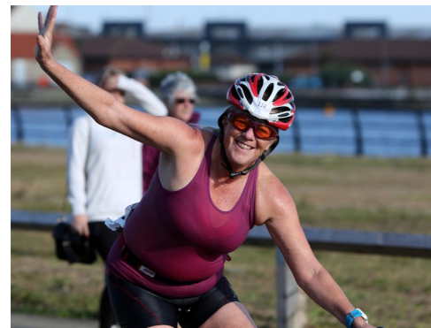
Our Big Lime Triathlon continues to go from strength to strength