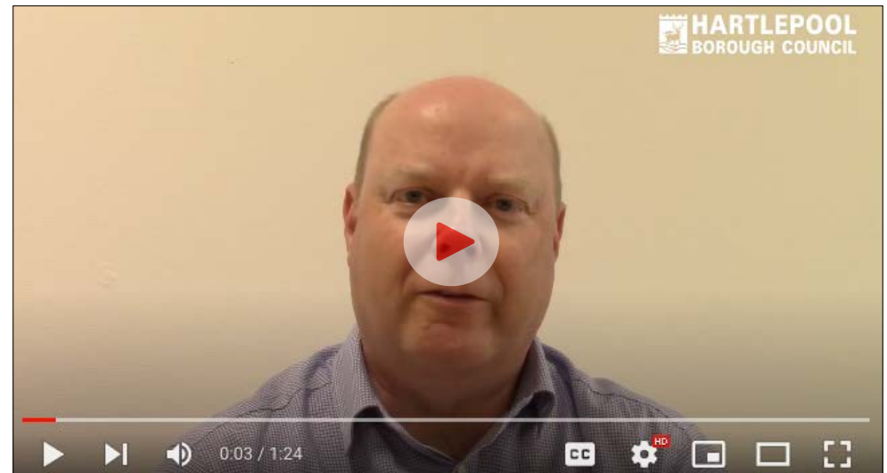
Video introduction by Craig Blundred

The report ends with what we can do together to help people in Hartlepool live happier, healthier and longer lives. This includes acting on the building blocks of health (good housing, food, community, education, work, money and transport), local information on support available to take healthy action and support to help with the cost of living .