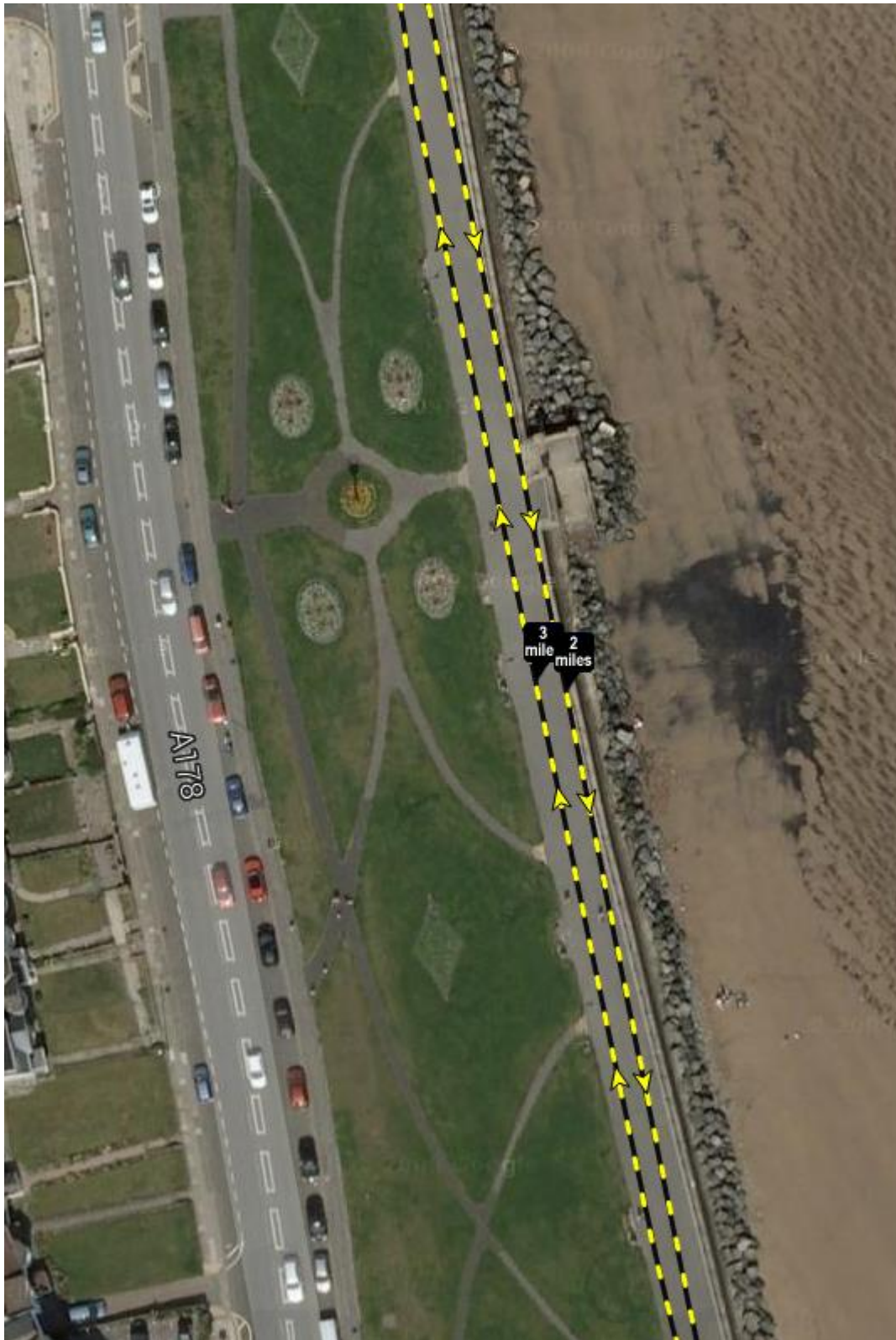
Miles 2 and 3 – marks are reference from the path that passes the Millennium Beacon to the access to the beach