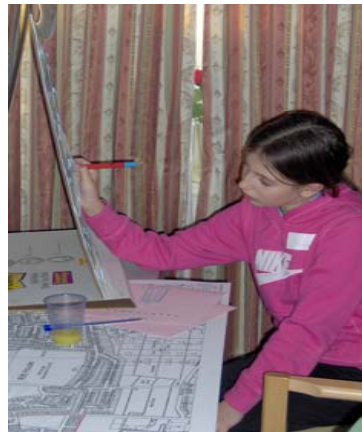
Pictures: The Community Conference held in February 2007 to obtain the community's views.