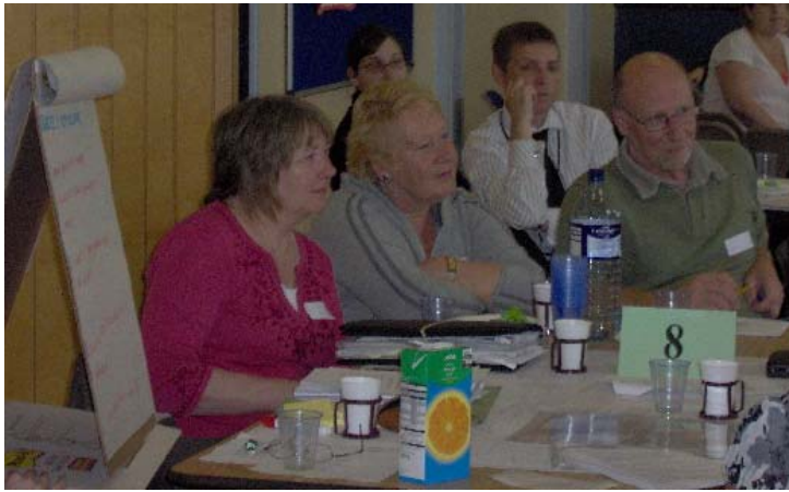
Pictures: The Community Conference held in July 2007 to obtain the community's views.