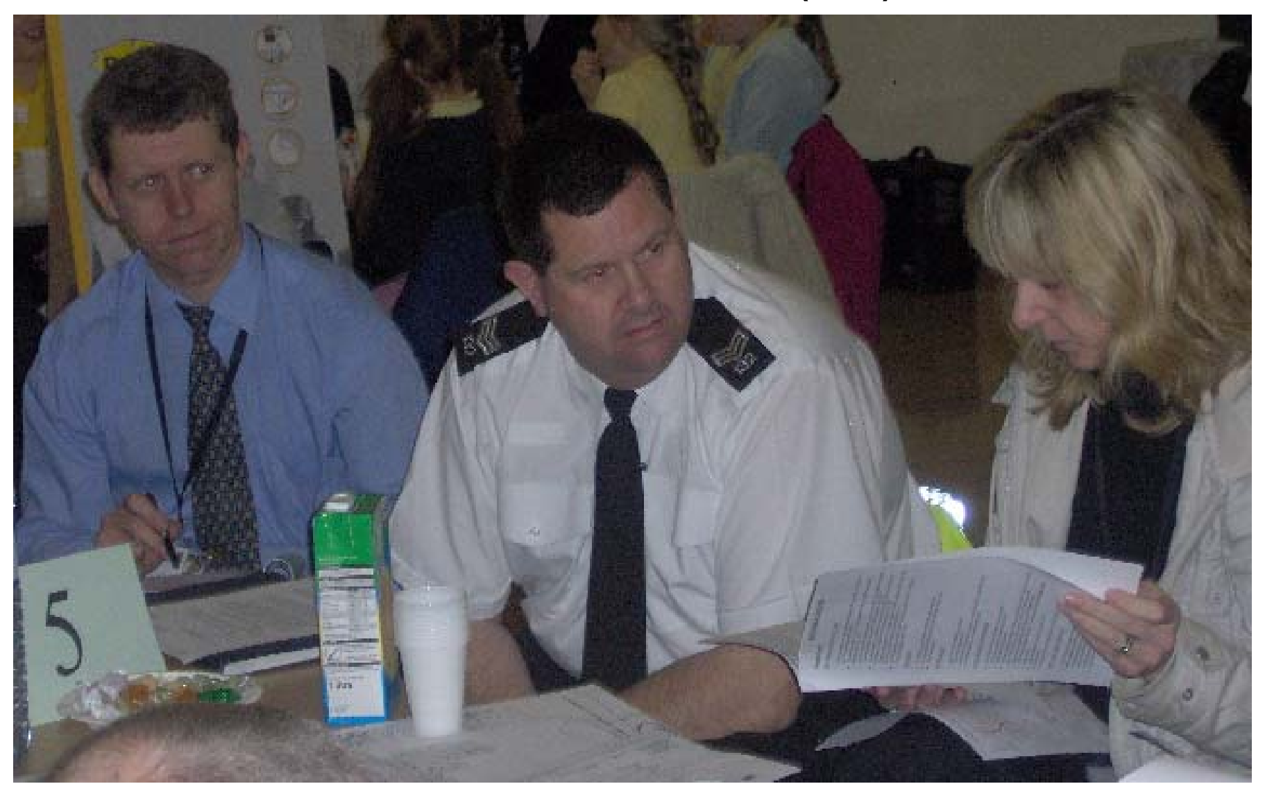
DRAFT ONE January 2008