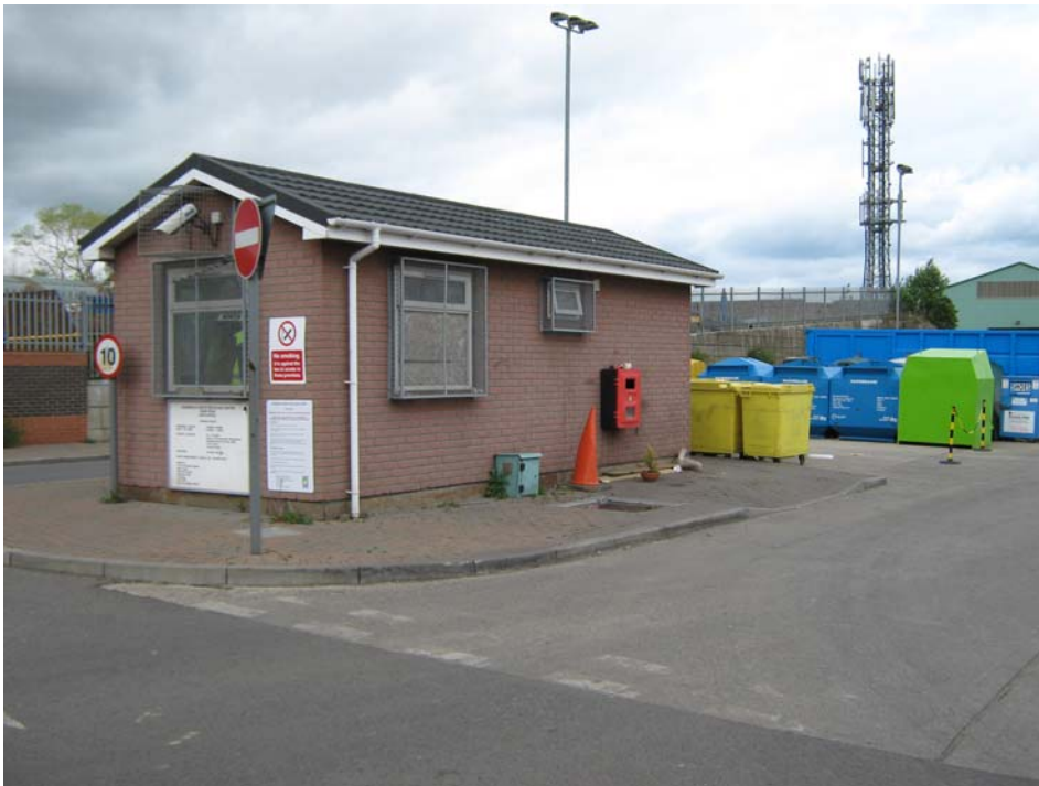
Entrance to Household Waste Recycling Centre