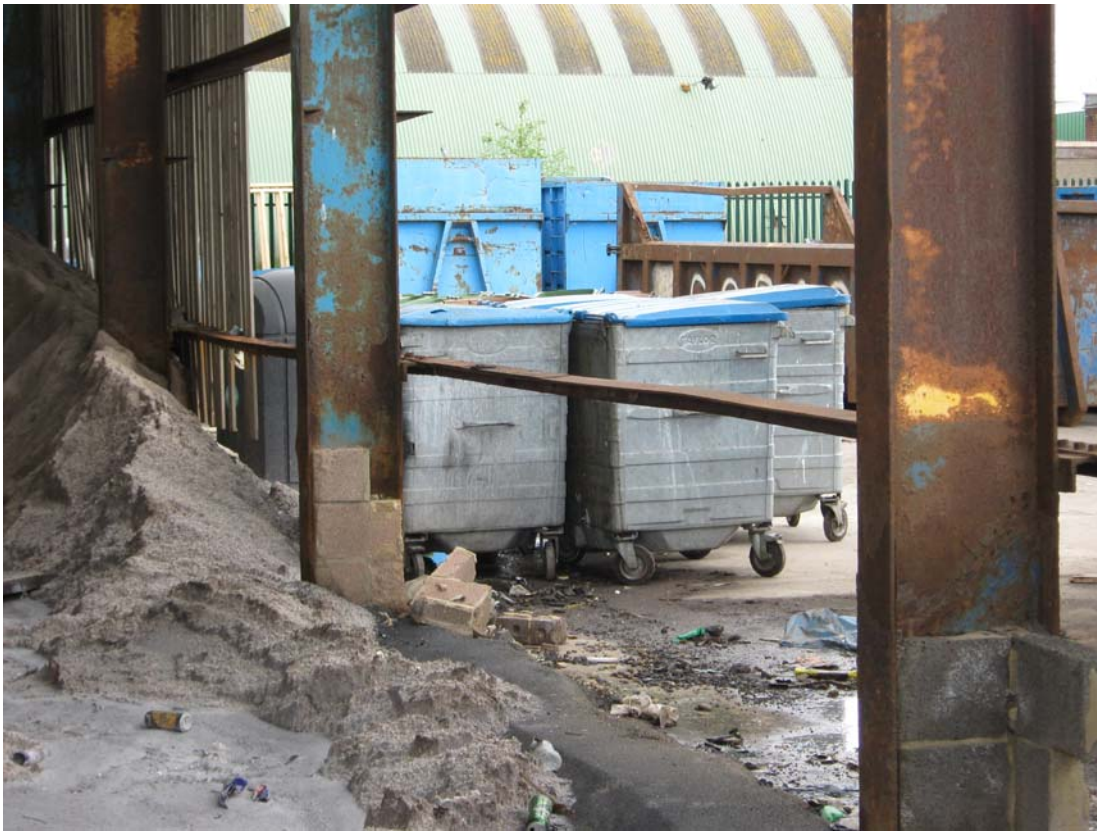
Salt Store Barn - Corroded Steelwork and Missing Masonry Wall