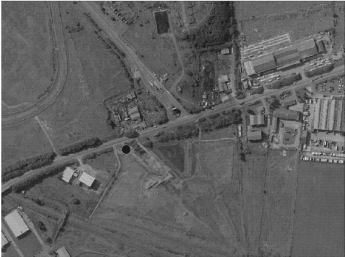
Proposed Salt Store Location (Blue Dot Indicates Rough Entrance to Proposed Site)