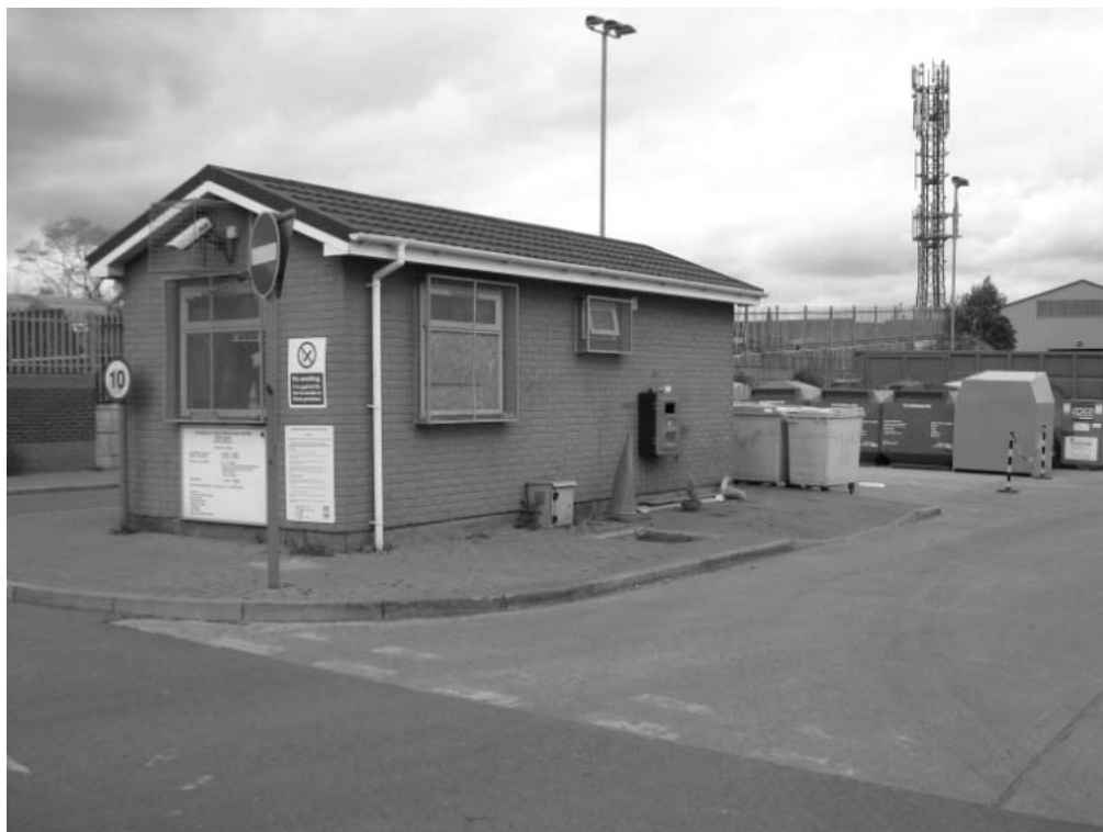
Entrance to Household Waste Recycling Centre