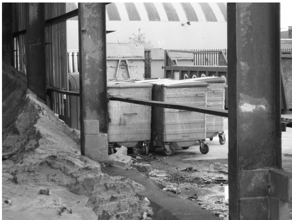
Salt Store Barn - Corroded Steelwork and Missing Masonry Wall