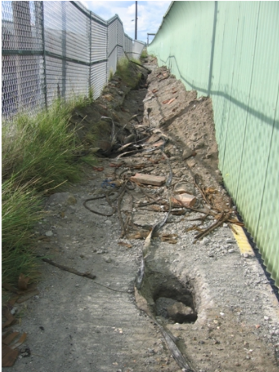
Photo 2 - Disruption to full Public Footpath width