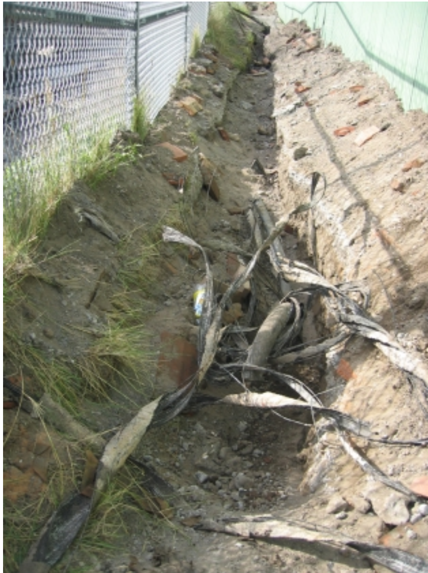
Photo 1 - Disruption to full Public Footpath width