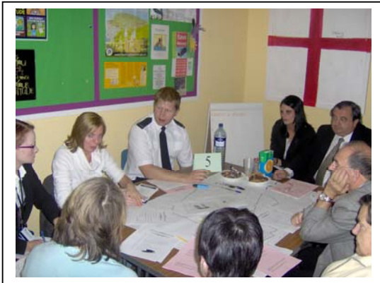
The Community Conference was held in October 2006 to obtain the community's views.

Success will depend upon the effectiveness of joint working with the community and between service providers. Community involvement has already positively encouraged the development of the NAP and a broad range of organisations and groups have been involved in this NAP. Many service providers, residents, school children, community / voluntary groups and Councillors have put a lot of time into developing this plan. This has included a Community Conference, held in association with the Community Network and Housing Hartlepool to obtain the community's views on their neighbourhood, plus individual meetings with service providers, BURT and community / voluntary groups.